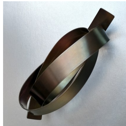
2 brooches: titanium