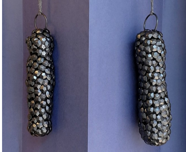
2 pendants: wood, iron, copper, graphite, lacquer / 2021